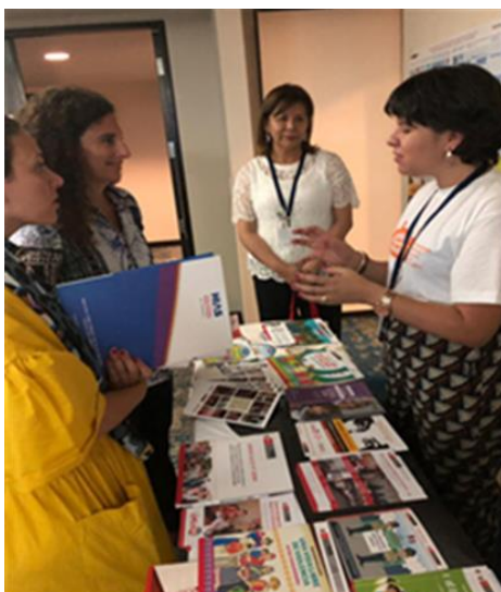
Day 1 RSSN Focal Point present the Network in Peru

The first day: the event opened with an overview of the Regional Safe Spaces Network (RSSN) , its origin, objectives, key principles, membership and activities. The presentation of the RSSN toolkit by RSSN focal points from different countries followed the opening session. Key tools discussed by participants included the standard RSSN Terms of Reference, the RSSN self-audit check-list, the RSSN online map, the interagency protection referral form, the SGBV and CP interagency referral pathways, the SGBV and CP case management flowchart, and the Regional Information Sharing Protocol.