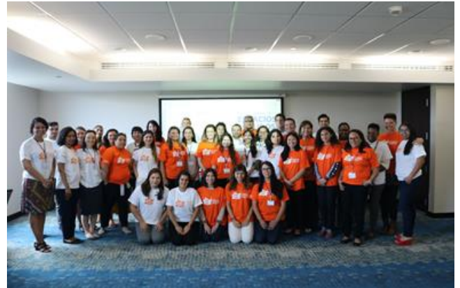
Group Picture RSSN workshop 2018

A total of forty-five (45) participants from seventeen (17) countries in the Americas region gathered in San Jose, Costa Rica to discuss the content of the RSSN toolkit, plan its implementation and share good practices. IOM, UNFPA, UNFPA, the Ministry of Women of Peru, the Child Protection Welfare Department of Venezuela, NGOs and UNHCR focal points were among them. The UNHCR’s Division of International Protection, and the Regional Office Nairobi, Kenya joined the event as well. The Human Rights Center of UC the Berkeley School of Law provided support to the event.