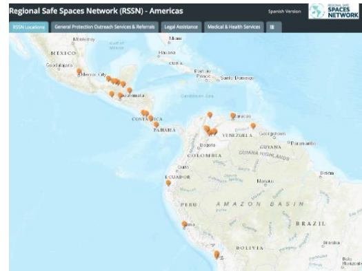
2 RSSN online Map

SGBV/CP section of the Regional Legal Unit of the Americas Bureau at rlu@unhcr.org .