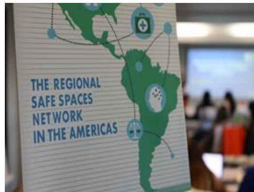
Material used during the RSSN workshop 2018

The first day concluded with an open Gallery Walk . The session provided an open space for RSSN members, government agencies and NGOs to present their best practices and products related to the RSSN and/or SGBV and Child Protection case and information management. The gallery walk proved to be an efficient tool to promote regional collaboration and cross-fertilization of successful practices.