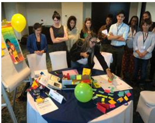
Day 2: a group of participants present their ideas on Safe Spaces for refugee and displaced children

A world café session was also held to discuss other key challenges and best practices related to Mandatory Reporting, Protection from Sexual Exploitation and Abuse (PSEA) and Complaint Mechanisms, and Survival Sex.